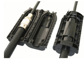
Picture shows WSHIELD-12-78 for illustration purpose