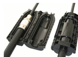
Picture shows WSHIELD-12-78 for illustration purpose